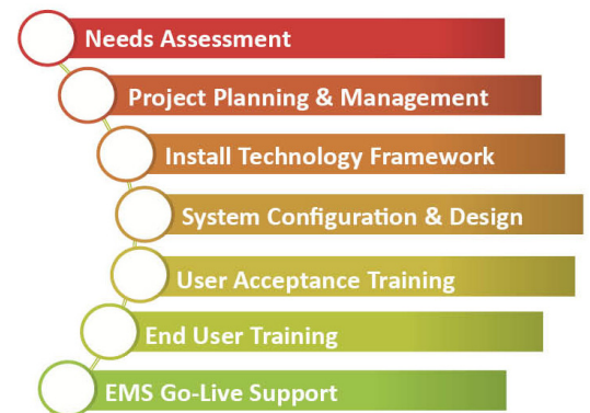
Typical Implementation Plan

Our conversion experts analyze data from your legacy system(s) and propose a plan to migrate or convert the information. We then design this solution and execute it with little or no down-time for your operation. If you would like a quote on the cost of a data conversion, please contact an account executive and be prepared to provide a sample of your data so we can formulate an accurate estimate.